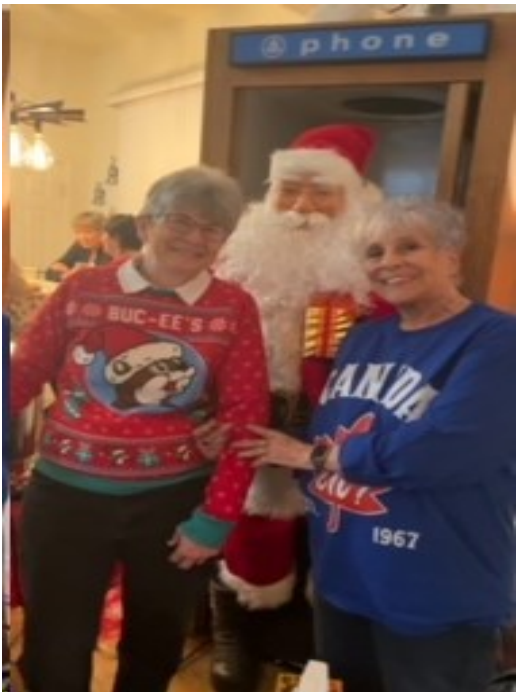
Santa arrived through a phone booth, just like Superman