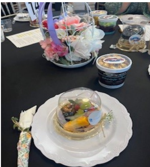
Lovely place setting at Sweet Fantasy

We extend our heartfelt thanks to Soroptimist International of Greater Las Vegas for hosting such a wonderful event and for their warm hospitality. Events like Sweet Fantasy remind us of the impact we can make when we come together for a common cause.