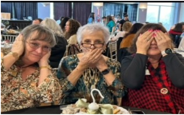
Showing off our individual afflictions